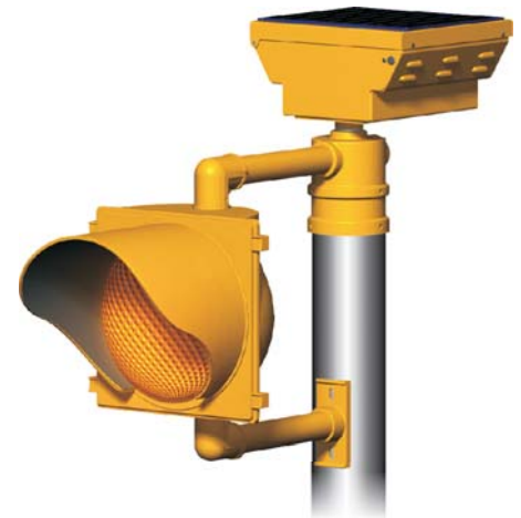
4.5" round sign post installation

Carmanah is a Canadian public corporation TSX VE: CMH