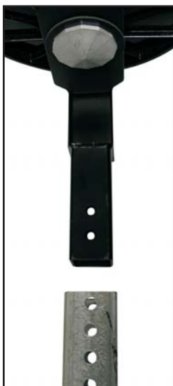
Installs in minutes to 2" square or round sign post