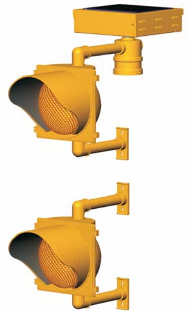
Optional single or dual beacon configuration

Toll-Free: 1-877-722-8877 (North America) Worldwide: +1 (250) 380-0052 Fax: +1 (250) 389-0040 Web: www.roadlights.com